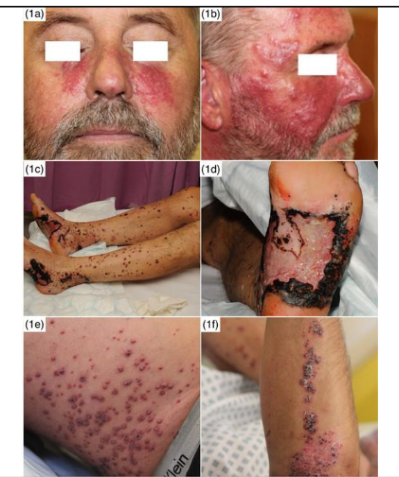
Figure 1: a) Multiple, tender, plum-coloured and edematous nodule plaques on the face after starting acitretin 50 mg/day for psoriasis. After restarting acitretin 20 mg/day, 1b) more severe eruption on face, c) tender, livid, hemorrhagic papulo-pustular eruption involving legs; d) large violaceous ulcerated plaques on sole; e) lower trunk and f) hemorrhagic lesions of Sweet's syndrome koebnerizing on psoriatic plaques on elbows.

A 52-year-old male presented with multiple tenders, plum-coloured and edematous plaques on his face (Figure 1a) after starting acitretin 50 mg/day for his psoriasis. He was systemically well. The possibility of retinoid-induced Sweet's syndrome was considered, and acitretin was stopped. The patient was denied biopsy and was reluctant to start any medication for facial lesions, which subsided in 3 months, but his psoriasis flared. He was reluctant to try phototherapy or immunosuppressives and wished to restart acitretin at 20 mg/day. After a week of restarting acitretin, he presented with fever and a symmetrically distributed, tender, livid, hemorrhagic papulopustular eruption involving the face, arms, legs and lower trunk with large violaceous ulcerated plaques on both soles (Figure 1b-f). He was admitted to the hospital and empirically started on intravenous (IV) flucloxacillin and IV acyclovir after obtaining blood cultures and lesional samples for Tzanck smear and viral PCR, which turned out to be negative. Given the clinical possibility of necrotizing neutrophilic dermatoses, 30 mg/day of prednisolone was added, and a skin biopsy was obtained.